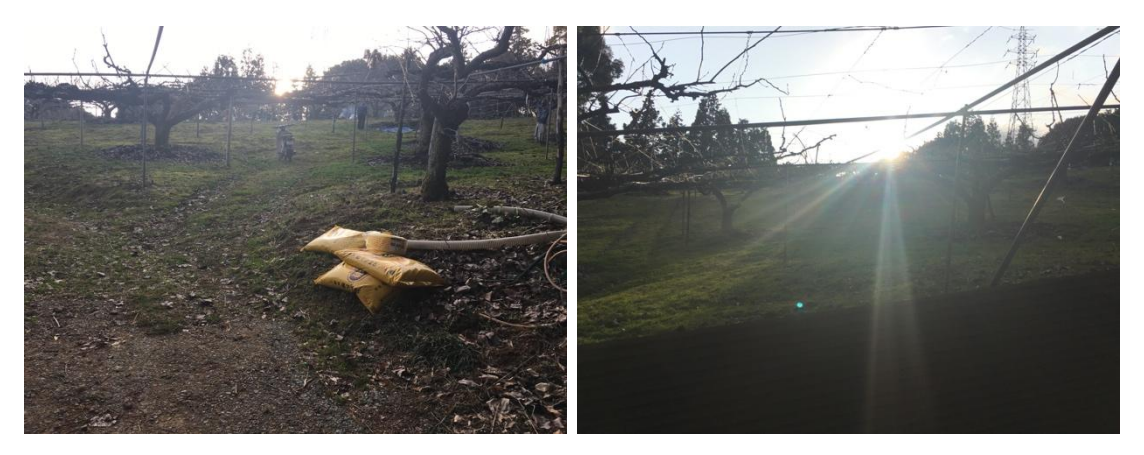
Top left and right: Pear orchards near the Akiyoshidai International Art Village.

hidden behind the small hill trail. The trees were much shorter than I imagined. Like the radiating root, the branches were pulled long on both sides with the twigs crossing one another on the neatly installed grid frames. This was for the convenience of farming and harvesting as the pear trees which could have grown tall were shortened and aligned neatly like chesses in the orchard. I often saw no man when I passed by riding a bike but could faintly hear the talks and music from the radio in the spacious orchards. I only saw two men from afar working busily in one super large farm and helping with other orchards when necessary. The serene and lonely winter scene against the backdrop of a mountain gave me a feeling completely different from cities and a sophisticated and complicated sense of time.